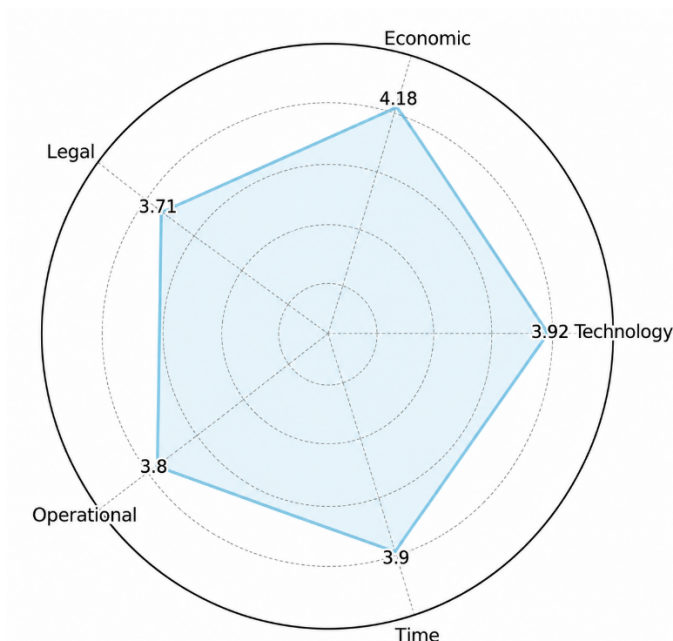
Figure 2. Radar Chart of Average TELOS Scores

Figure 2 illustrates the radar chart representing the average feasibility scores of the e-HakCipta DJKI system for Sentra KI in Samarinda across the five TELOS aspects. The chart reflects aggregated perceptions from seven respondents representing various Sentra KI partner institutions. The displayed scores are calculated as the average of all indicators within each dimension. The visualization reveals that all aspects scored above the midpoint (3,00) on a 1-5 Likert scale. The Economic aspect obtained the highest score, 4.38, indicating that most respondents acknowledged the improved efficiency in time, cost, and resources offered by the new system. This finding suggests that the digital transformation through e-HakCipta has effectively reduced administrative burdens and manual processing costs previously experienced by institutional users.