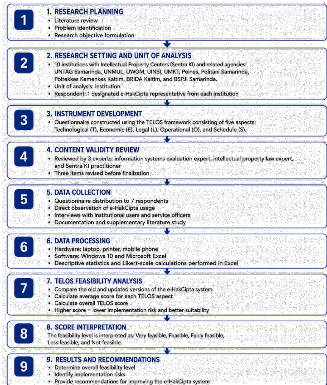
Figure 1. Research Flow

level of the e-HakCipta system is determined, enabling the identification of implementation strengths, potential risks, and recommendations for system development.